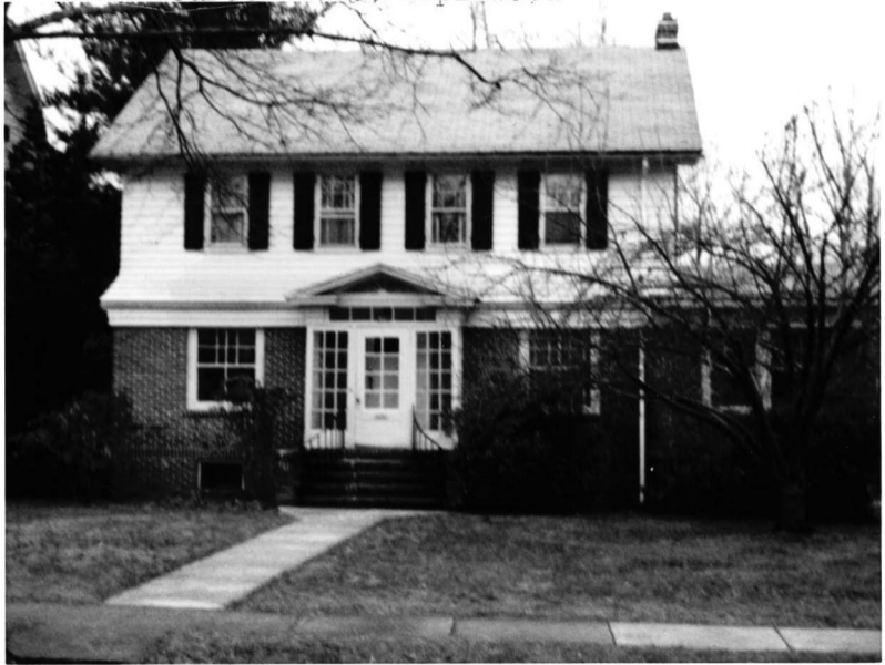
22 Courter Ave., Maplewood